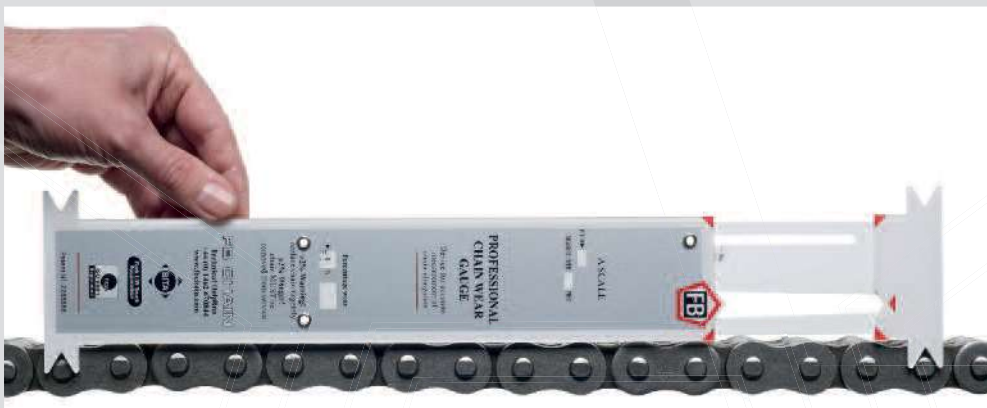
FB Kettenmesslehre für Flyerketten und Rollenketten